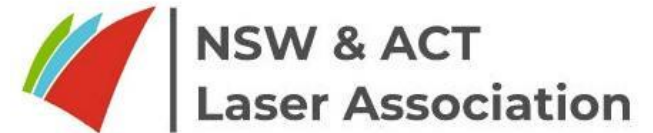
Illustration A Regatta Site