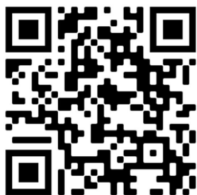
Figure 1 - QR Code Sign On / Off